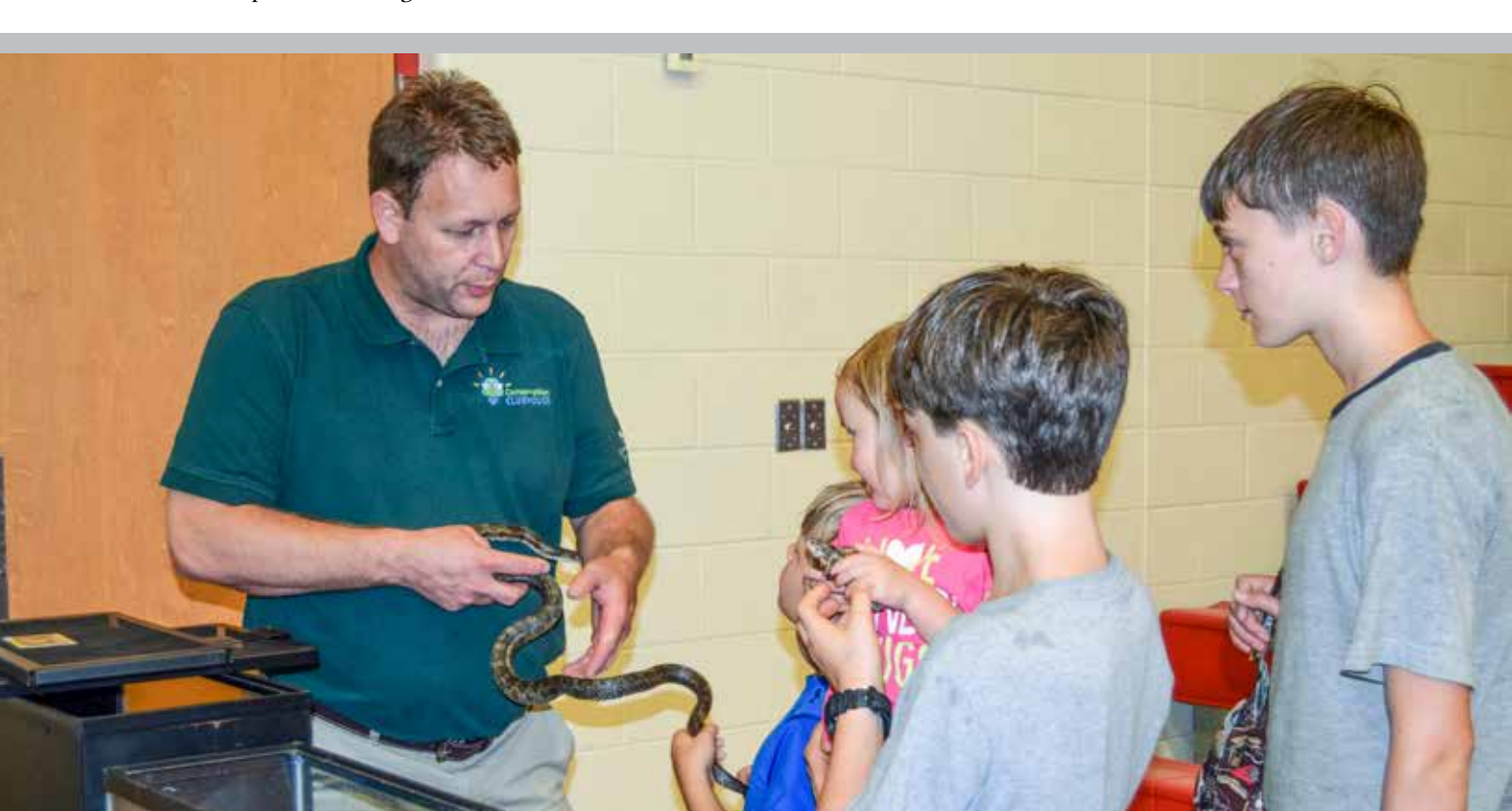
JMB Biological Services, LLC provided a live reptile show for our members and their families at the 2017 Annual Meeting.

Shelby Energy thanks you for your trust, support and membership. Our members provide stability and a sense of local ownership. You are more than customers, you are member-owners. Together, we are Member Strong.