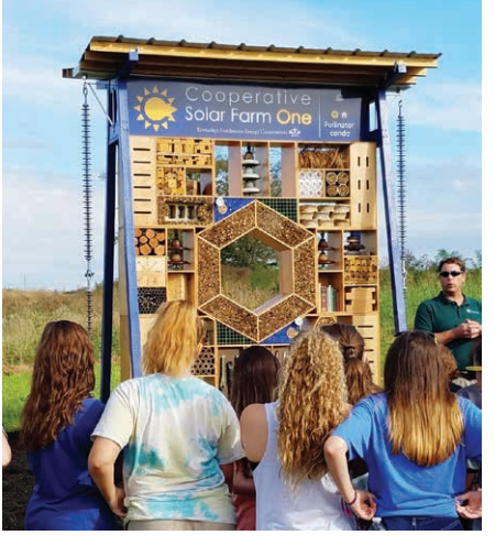
Visitors enjoy the farm's pollinator station, providing nesting habitat for native bees, butterflies and other insects that pollinate nearby trees and flowers.

a habitat that accommodates insects to pollinate flowers and plants. Last year, the beehives on the farm yielded 76 pounds of honey—a sweet reward for caring for our Kentucky home.