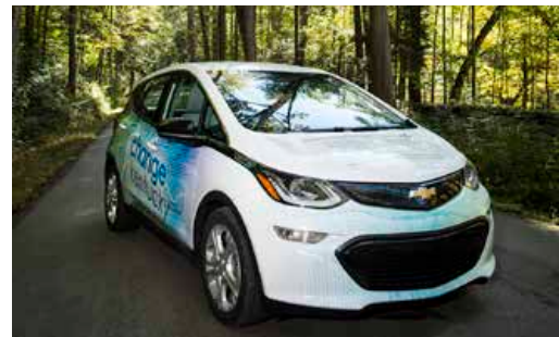
EKPC Chevy Bolt is available to member coops to become familiar with the technology to assist members with questions.

Cost is also contributing to the growing popularity of EVs. Their prices are falling, making them competitive with conventional internal combustion engine vehicles. Plus, they cost less to fuel. The U.S. Department of Energy says electricity to fuel an EV is equal to $1 per gallon of gasoline. EVs are also