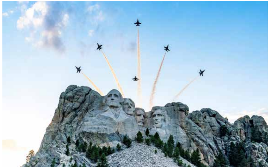
Military aircraft at South Dakota's 2020 Mount Rushmore Fireworks Celebration on July 3, 2020.

Submitting a 1909 report to Congress by the Commission on